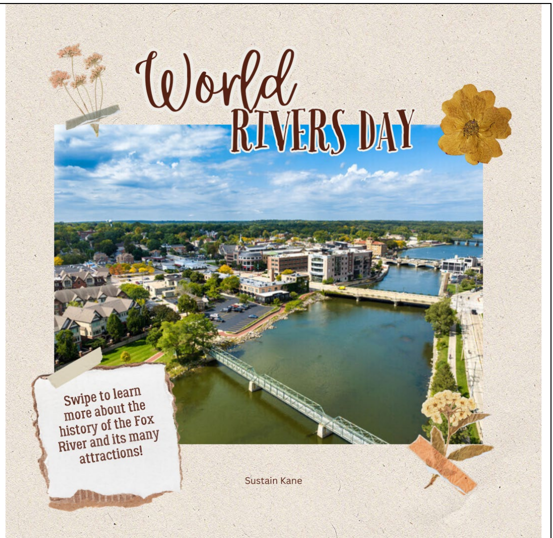
First Page of 9 Slides Bringing Awareness to World River Day